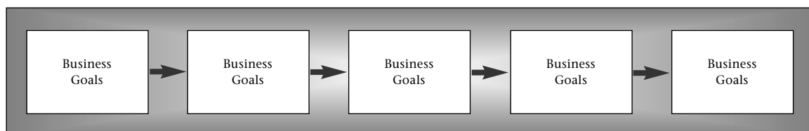
Figure 1: A model for linking business goals with individual and organisational performance (from Gratton, 2000, p.10)

In this model, business goals are defined and the context for people to perform is developed. Employees' behaviour determines the meeting of business goals, influencing organisational performance, and ultimately financial