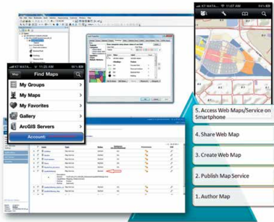
Fig. 4: Authoring and publishing featured contents.

The background preparations for the Mobile GIS Application for Quality Managers and Surveyors involve modeling the GIS data to meet the requirements of the task performed by the managers and surveyors. Appropriate GIS data is used to Author Map that shall server for publishing map resources. While publishing the resources “feature access” is enabled as a capability of the published features service. The next step is to add the feature service as content of your ArcGIS Online using global account and create a Web map. Once the Web map is created it is shared to group for surveyors and managers. The managers and surveyors should have an account on ArcGIS Online or they can create a new one and add themselves to the group in order to access the featured maps content.