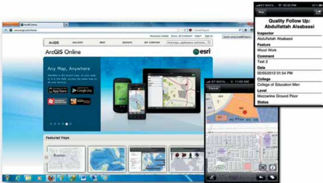
Fig. 2: ArcGIS Online and ArcGIS for iOS.