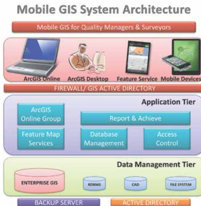
Fig. 3: Mobile GIS system architecture.

The mobile GIS application is developed using Esri technology. The system architecture is three tiered consisting of database tier, application tier and end user applications. Fig. 3 below illustrates the system architecture: