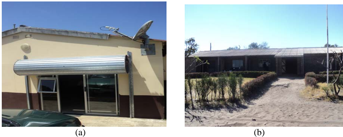
Figure 2: Telecentres: (a) Comsol telecenter in Umbumbulu, KZN, South Africa (b) Kanyonyo resource center in Mongu, Zambia

Centre in Mongu Zambia. (See Figure 2) (Note that a number of telecentres were visited in South Africa and Zambia, but we present a select few results due to space.)