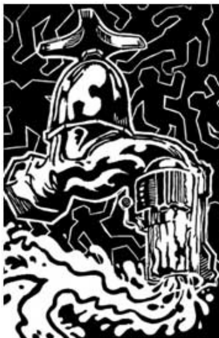
Figure 2 Student (B) Untitled Linocut print. Size A4. 2006

material wealth and discriminatory treatment by society. His journey to and from the university was educational, in the sense that he became aware of the lack of human rights practice among the people who mattered. In his first graphic print based on Article Twenty Four of the Bill of Rights, that is, 'Environment' (Republic of South Africa, 1996:24), Student A explained that this image was as much about social inequity as it was about the environment. In his print (Figure 1), the symbolism is two-fold; firstly, the upper composition depicts the environmental effects of industrialization and globalization, that is, the way in which technological advances in industry and global communications pay scant regard to their effect on the environment. The image addresses the danger of rampant pollution in a fragile natural world, symbolized by the brittleness of an animated tree. Student A juxtaposes technology with poverty symbolized by the group of urban dwellers, which he based in the township of Soweto. The composition addresses the sharp distinction between the level of historical disenfranchisement that contrasts an image of urban poor people against the economic advantage of a growing technology and communications sector.