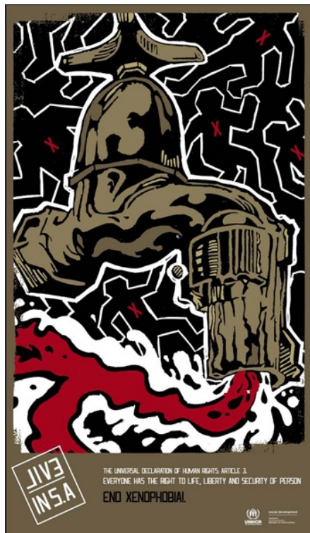
Figure 4 Student (B). Untitled Digital print. Size A4. 2008