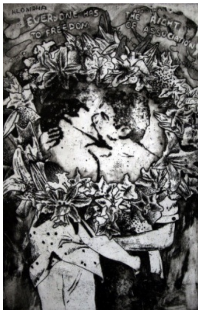
Figure 3 Student (C). Second Year: Etching. Untitled. Size A4. 2009

The second-year printmaking module of the Visual Graphics course comprises a series of five projects over the year that aim to engender a critical sense of social responsibility. The third example (Student C) referred to in this article is an etching project based on an Introduction of the Civic Learning Spiral. The theme explores an aspect of social justice which introduces notions of civic engagement in the education process.