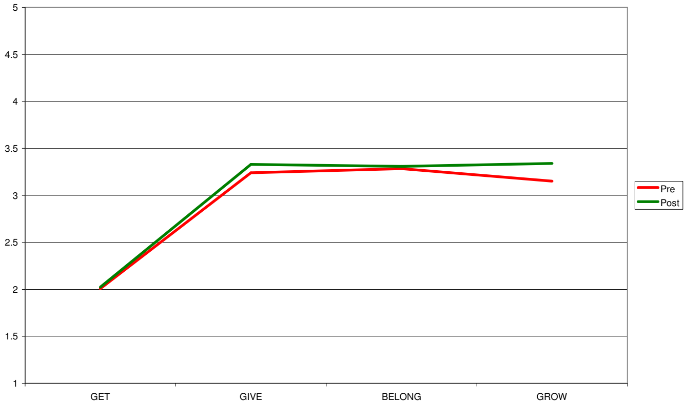
Figure 2. Mean per group per dimension.