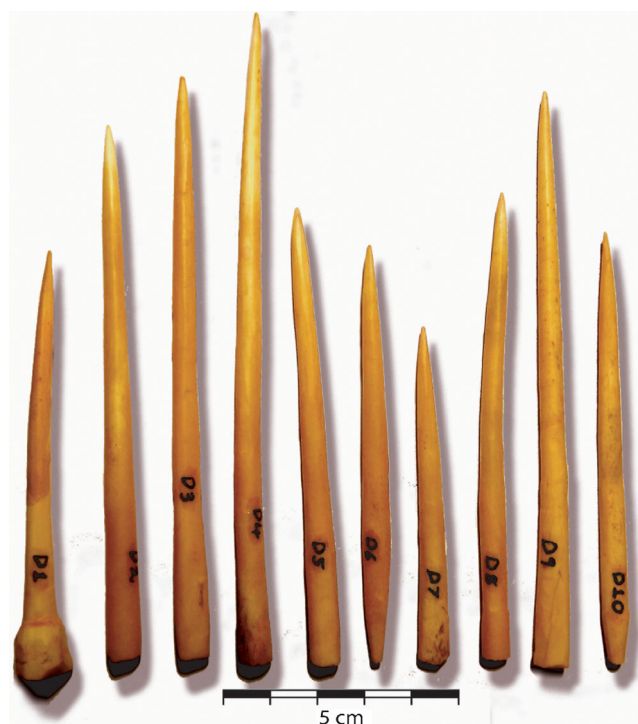
Fig. 2 Examples of bone points used in the experiments

The bone points were mechanically ground to the dimensions commonly accorded to archaeological bone points (e.g. Vinnicombe 1971; Smith and Poggenpoel 1988) and which matched those used in previous macrofracture