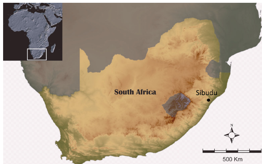
Fig. 1 Map of South Africa

avoid confusion with accidental breakage patterns (Fischer et al. 1984; Lombard 2005a). Although bone differs from stone in many respects, both share the properties of brittle solids and therefore follow similar fracture patterns (Lawn and Marshall 1979; LeMoine 1994), a fact that has been borne out in subsequent experimental studies (e.g. Griffiths 2006; Bradfield and Lombard 2011). Unfortunately, this method does not distinguish between hand-delivered and mechanically delivered weapons, nor does it necessarily distinguish between other causes of longitudinal impact (Lombard et al. 2004; Lombard 2005a).