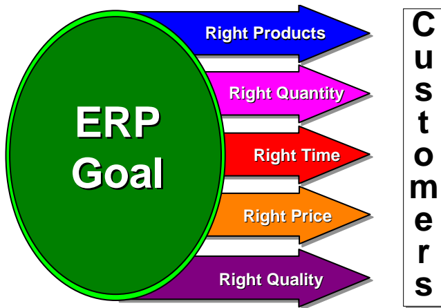
Fig. 2 The goal of enterprise resource planning [3]