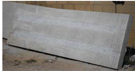
(b) Completed scabbled surface