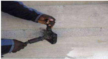
(a) Scabbling process

Figure 2 shows scabbled surfaces from the current investigation. The scabbled surfaces were achieved using the pneumatic machine. About 3 mm depth of scabbling was conveniently achieved, and it can be observed that this is adequate as the aggregates have been well exposed before the steel plate is bonded to the concrete surface. It should be noted that it may be necessary to putty fill any void or bug holes that might have been created by the removal of some loose aggregates during scabbling. This is done to prevent the formation of air bubbles at the concrete-epoxy interface that may adversely affect bonding between the steel plate and the concrete.