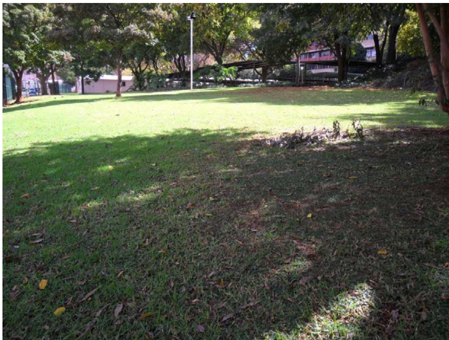
Figure 1. Photograph of a stretch of land surveyed by student group.

As part of a practical exercise in land surveying, the first year civil engineering diploma students at the institution at which this research was conducted were required to engage in a process of obtaining the relative elevations above sea level of a stretch of ground. Figure 1 is a photograph of a stretch of land chosen by one particular group. Through the use of various items of surveying equipment, such as a dumpy level and staff, and some additional computation, Table 1 was developed. Table 1 is a 're-presentation' of the landscape pictured in Figure 1. Figure 1 itself constitutes a transduced representation of this particular stretch of land. The differences between the photograph and the table are that different technological tools were utilised in their production, that different social practices were involved in this production and that the table represents the land surface with a much higher degree of abstraction than the photograph does. Despite this, both Figure 1 and Table 1 present a snapshot of this specific piece of land.