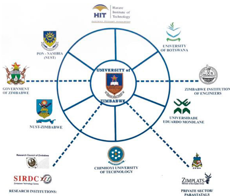
Fig. 1. EEEP Hub and Spoke Arrangement.

In response to the challenges in retaining engineering skills within the profession, the University of Zimbabwe (UZ) and the University of Dar es Salaam (UDSM) were selected to drive the RAEng initiative on Enriching Engineering Education Program (EEEP) in Southern and Eastern Africa respectively [6]. The EEEP facilitated the association of Sub-Saharan Africa engineering faculties through sharing and disseminating knowledge and best practice in order to stimulate a synergistic raising of standards in engineering education across the region [6]. The UZ partnered with Spoke Institutions (SIs) and other organizations as shown in Fig. 1. The program ran from 2013 to 2015 through 3 main activities, i.e. the secondment of engineering staff to industry to equip them with requisite industrial experience, knowledge sharing workshops as well as professional training. While the EEEP initiative was largely successful, it could only be sustained within the 2-year period due to funding constraints. This paper provides details on what was accomplished as well as building on the achievements to resolve weaknesses by developing a holistic systems thinking model for capacity building and sustainability in engineering education.