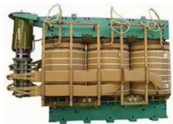
Figure 3: Active part of a power transformer [2]

The following figure below shows the active part of a power transformer, consisting of the windings covered in cellulose insulation.