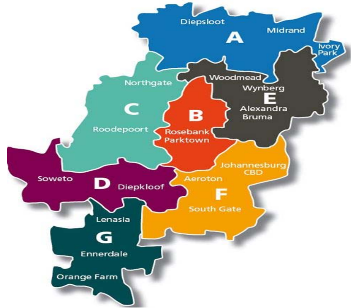
Fig. 1 City of Johannesburg Regions

Currently, at CoJ, there are four active LSs. They are Robinson Deep with about 7 years to its end of life, Goudkoppies with about 15 years remaining to be closed, Ennerdale with about 13 years left and Marie Louise with about 6 years left to be closed (Table 2). Each of this site received approximately about 1000 tons of wastes or less on daily basis and one of the them, Robinson Deep LS operates for a period of 24 hours daily [33].