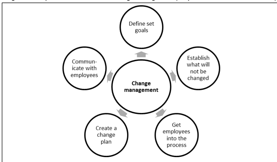
Figure 1 Components of successful change management (Stripeikis & Zukauskas 2005: 333)

Successful change management relies on a structured approach aimed at ensuring that the transition from the current state to a desired state is achieved (Ntsunguzi 2007: 14, Bold 2011: 12). Essentially, the objective of change management is the empowerment of individuals which, in turn, will lead to the organisation transitioning to the desired future.