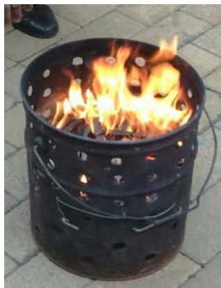
Figure 1: Brazier ignited using the TLUD ignition method

Ventilation rates affect the overall performance of the stove and these rates differ significantly from one device to the other. To evaluate realistically and compare the performance of two or more braziers, ventilation rates need to be specified. Ventilation rates for the experimental brazier used in the study are given in Table 1.