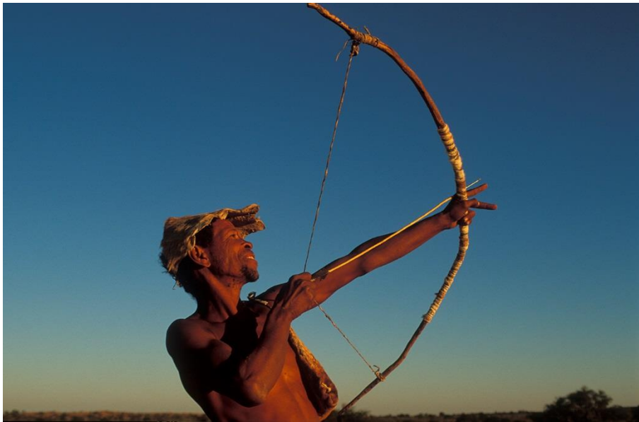
Figure 1: San man hunting with bow and arrow, Kalahari, Northern Cape, South Africa (photograph used with permission from Ariadne van Zandbergen©, The Africa Image Library).