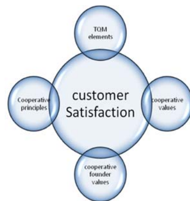
Fig. 3. Customer satisfaction frameworks within cooperative enterprises