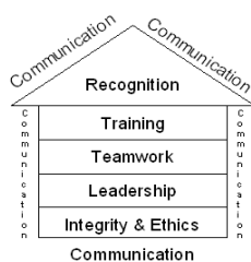
Fig. 1. Elements of TQM

The implementation of TQM is successfully done through the eight basic elements of TQM. TQM has been used by a number of organizations in both public and private sectors and in manufacturing and service industries to introduce the basic elements and practices [7]. It is important to clarify and identify TQM elements and characteristics of the product and service which the customer finds attractive. These elements are demonstrated in Fig. 1.