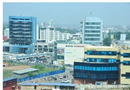
Plate 2 View of Airport City Project, Accra