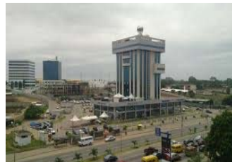
Plate 5; Silver Star Tower