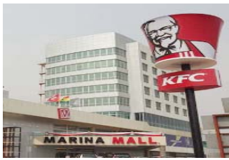
Plate 3; Marina Shopping Mall

completion except the airport city hospital complex yet to commence. The study considered one each of the different types of projects developed at the enclave namely: hotel, office tower, shopping mall, bank and mixed-use development in relation to stakeholder management and sustainability principles. The projects are the Silver Star Tower, 3-Star Holiday Inn Hotel, exquisite UT Bank, One Airport Square (a mix commercial), Marina Shopping Mall, SSNIT Emporium adding to the elegant spectacle of the Airport City and the 13-storey complex with a revolving restaurant at the summit, cinema halls, retail outlets and offices selected due to their complex architectural design, availability of information or public interest. Stakeholder and sustainable development considerations for the overall project, individual projects, and needs of interested or affected individuals, groups and simultaneous devotion to economic, social and environmental goals for sustainability were explored.