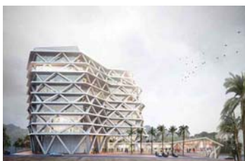
Plate 4; One Airport Square

The Marina Shopping Mall is a dual commercial development owned by Marina Market, a daughter company of Marina Group in Burkina Faso, 9000sqm area, has over 45 outlets, spread across three floors and one of the four shopping malls in Accra managed by Broll Ghana, the others A&C Square (10,000sqm) Accra Mall (20,000sqm) and the West Hills Mall (27,000sqm) in Weija-Accra ( marinamallghana.com ) The mall was opened in 2012 in the multi-purpose shopping and office hub at the Airport City enclave, serves as a hangout, meeting place during week ends and the success of it attributed to the growing middle and upper class income group in Accra as a result of the economic growth of 14% in 2007 and desire for people to shop in a modern environment ( modernghana.com/news ). The Holiday Inn, Hotel is part of the African Sun group well located for the business traveller or adventurous tourist with 168 appointed rooms. It has the Wiase Restaurant, overlooking the sparkling pool and the La Cabona Pool Bar. The SSNIT Emporium on the other hand is a corporate ultra-modern office complex, has a main building and a tower with about 15,400sqm, biggest commercial office space in Accra, well sited, aesthetically pleasing designs and greenery and belongs to the Social Security and National Insurance Trust with several estate developments in Ghana.