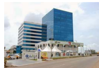
Plate 3; UT Bank, Manet Towers

The airport city project cannot be mentioned without the One Airport Square project, which has an outstanding architectural traditional character, nine floors of office space and 2000sqm retail space designed by the award winning sustainability architect Mario Cucinella. The Silver Star tower has