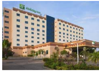
Plate 4; Holiday Inn Hotel