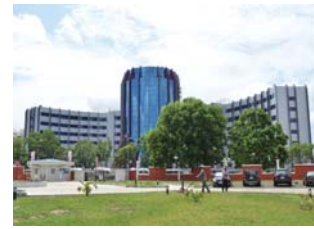
Plate 5; SSNIT Emporium

The Marina Shopping Mall is a dual commercial development owned by Marina Market, a daughter company of Marina Group in Burkina Faso, 9000sqm area, has over 45 outlets, spread across three floors and one of the four shopping malls in Accra managed by Broll Ghana, the others A&C Square (10,000sqm) Accra Mall (20,000sqm) and the West Hills Mall (27,000sqm) in Weija-Accra ( marinamallghana.com ) The mall was opened in 2012 in the multi-purpose shopping and office hub at the Airport City enclave, serves as a hangout, meeting place during week ends and the success of it attributed to the growing middle and upper class income group in Accra as a result of the economic growth of 14% in 2007 and desire for people to shop in a modern environment ( modernghana.com/news ). The Holiday Inn, Hotel is part of the African Sun group well located for the business traveller or adventurous tourist with 168 appointed rooms. It has the Wiase Restaurant, overlooking the sparkling pool and the La Cabona Pool Bar. The SSNIT Emporium on the other hand is a corporate ultra-modern office complex, has a main building and a tower with about 15,400sqm, biggest commercial office space in Accra, well sited, aesthetically pleasing designs and greenery and belongs to the Social Security and National Insurance Trust with several estate developments in Ghana.