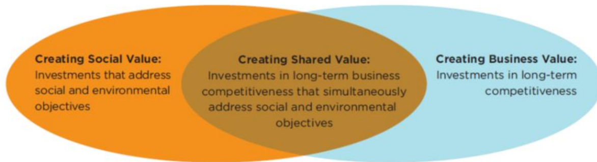
Fig 2. Creating Shared value [6]