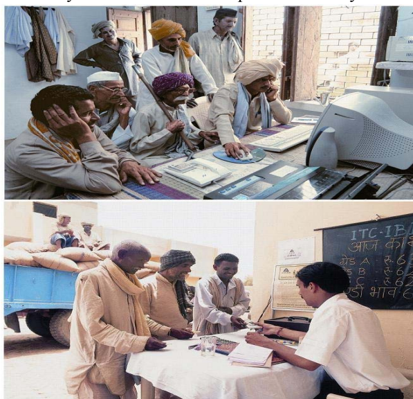
Fig.1. Farmers gather at the Choupal to access latest information available on the information portal and the sanchalak playing the role of facilitator.

ITC’s e-Choupal digital revolution has benefited 3.5 million farmers and has won a World Business Award on 19 th May 2004 and a Development Gateway award in