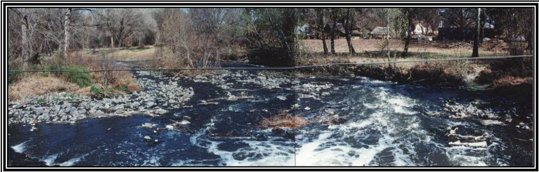
August 1998, downstream view.