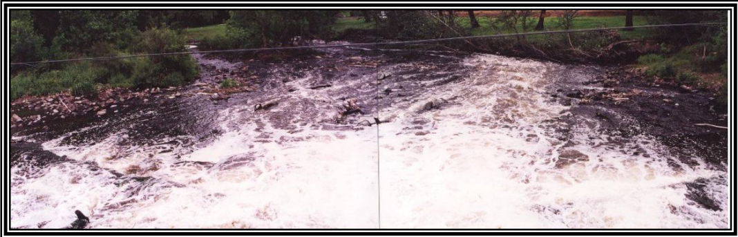
November 1997, downstream view.