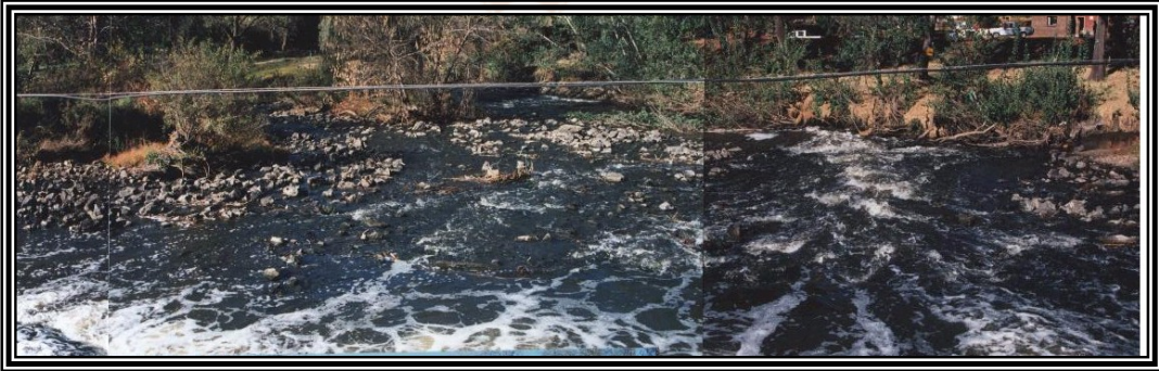
May 1998, downstream view.