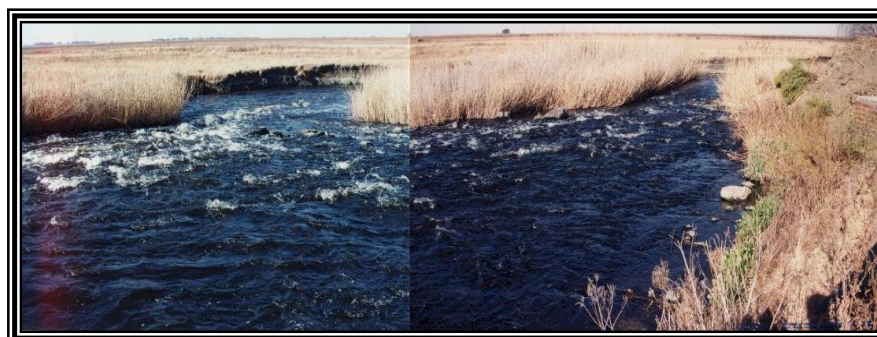
August 1998, downstream view.