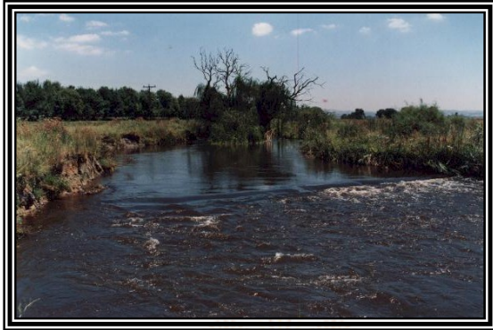
Februarv 1998. unstream view.