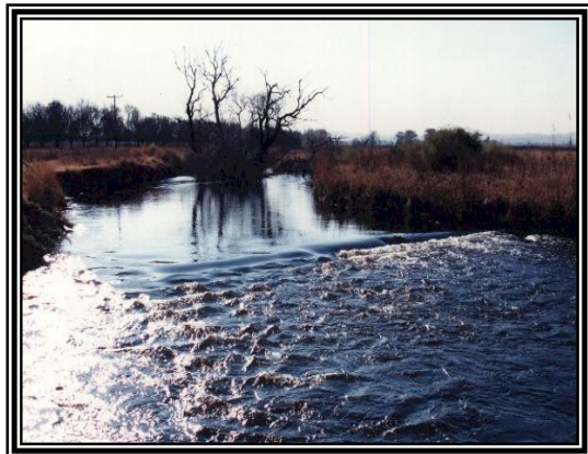
August 1998, upstream view.