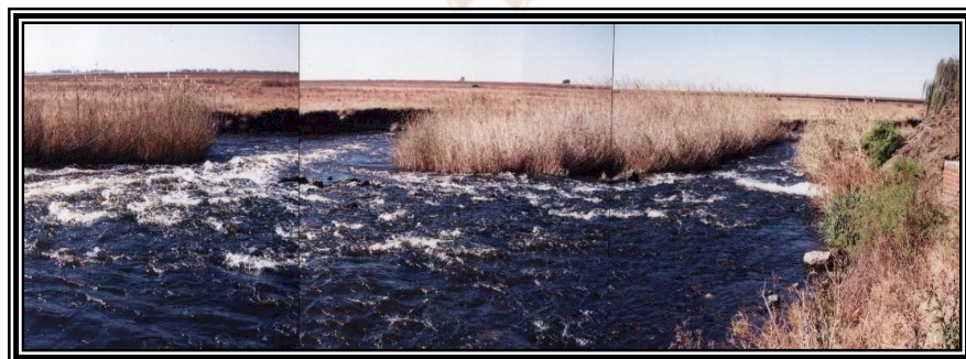
May 1998, downstream view.