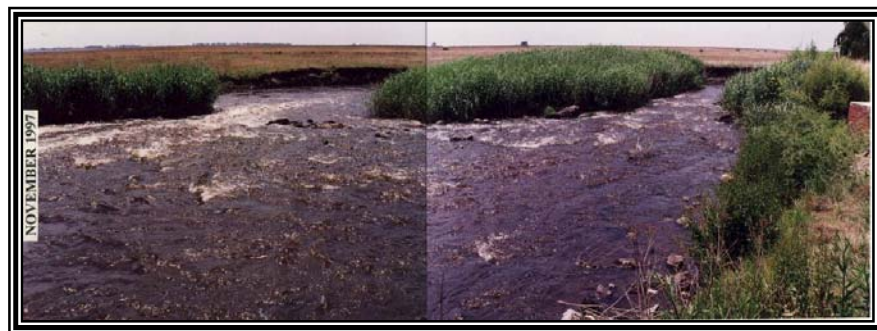
November 1997, downstream view.