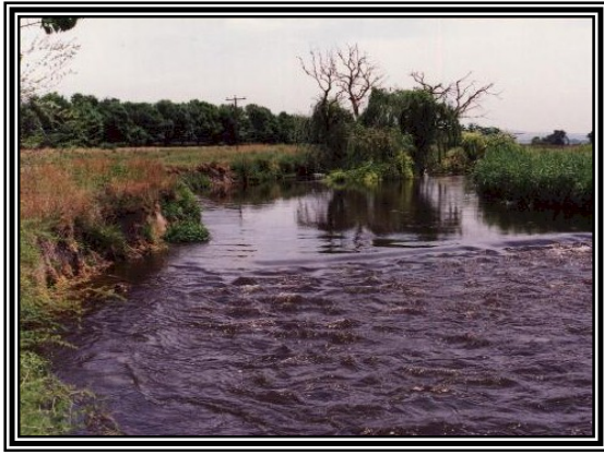
November 1997, upstream view.