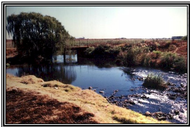
May 1998, upstream view.