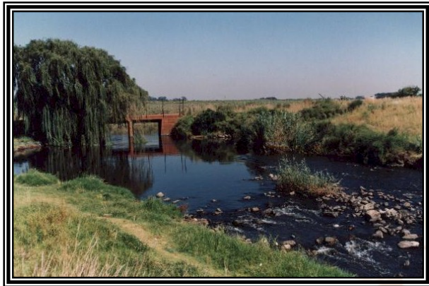
February 1998, upstream view.