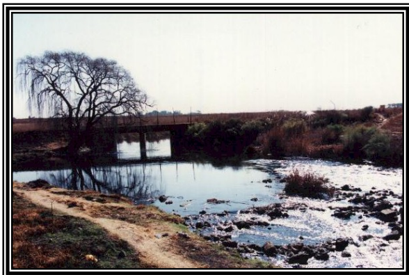
August 1998, upstream view.