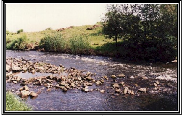
November 1997, downstream view.