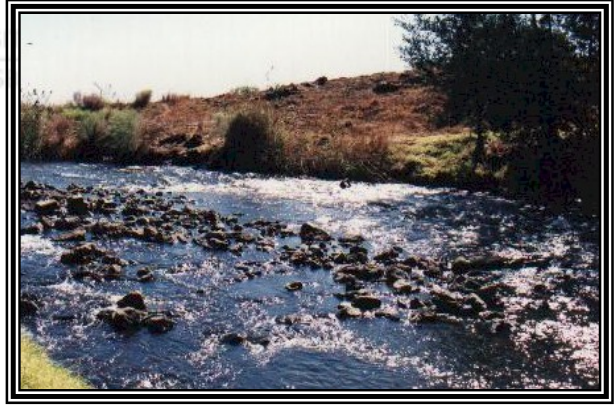
May 1998, downstream view.