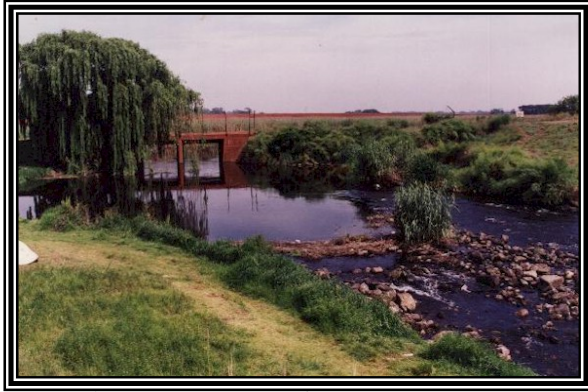
November 1997, upstream view.