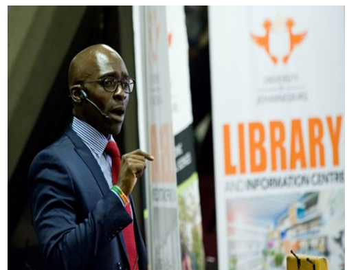
Minister Malusi Gigaba