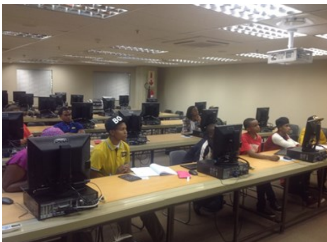
Students attending iPad training sessions

The library is playing a vital role in the facilitation of iPad training and workshops to both staff and students. A number of workshops have been presented in partnership with the Centre for Academic Technologies and the Core Group. More training workshops are planned for, in the forthcoming months. Hopefully by the end of these workshops, both staff and students will be comfortable in using the devices for academic purposes.