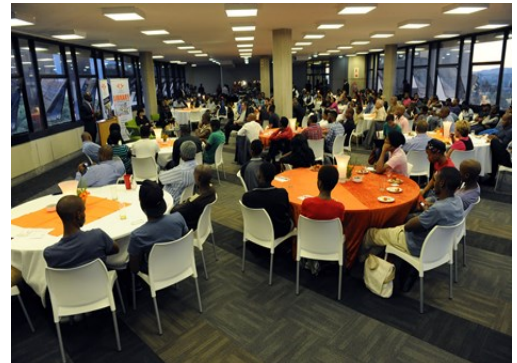
Level 6 Auditorium